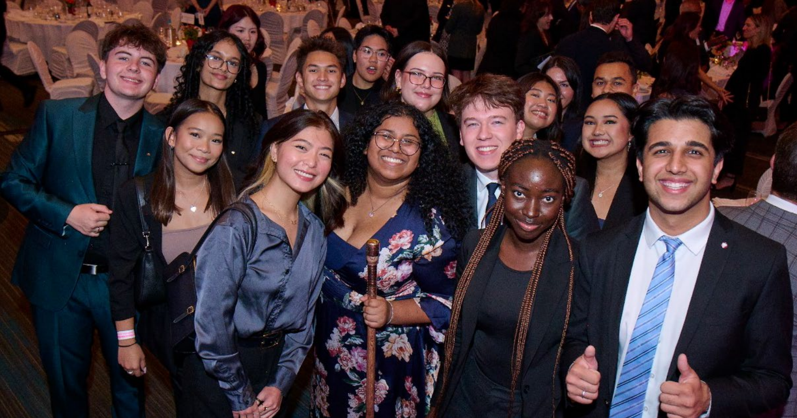
Students and members of the Commerce Students' Association enjoying the 2024 IGNITE Awards hosted by the Young Associates on September 18, 2024