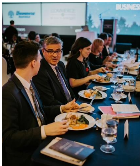
Guests enjoy a meal at the 53rd CSA Business Banquet