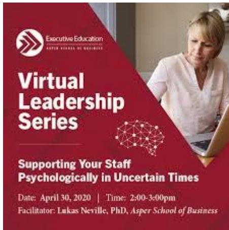
Facebook Advertisement: Executive Education Virtual Leaders Series