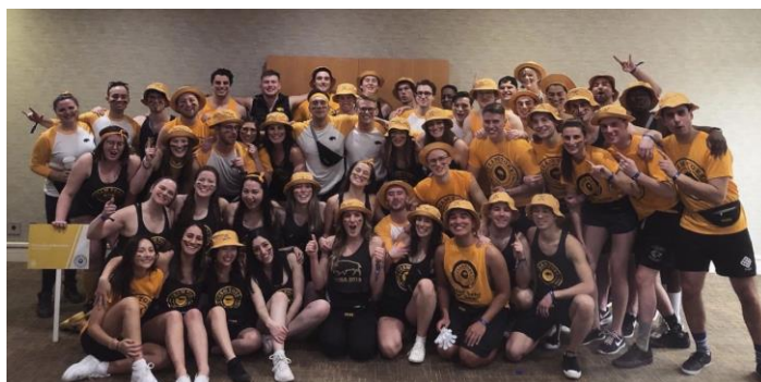
Asper School of Business' 2019 Team Toba

JDC West is the largest student-run business competition in Western Canada, attracting teams from 12 universities each year. Over 500 students from 12 of Western Canada's top universities unite annually to compete in this competition that is solely organized by and for business students.