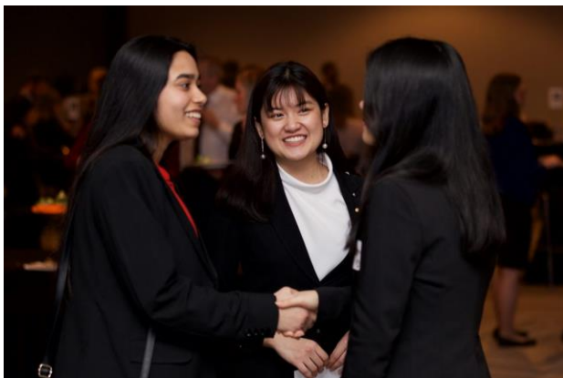
Students attending the 12 th annual Celebrating Co-op event at the RBC Convention centre