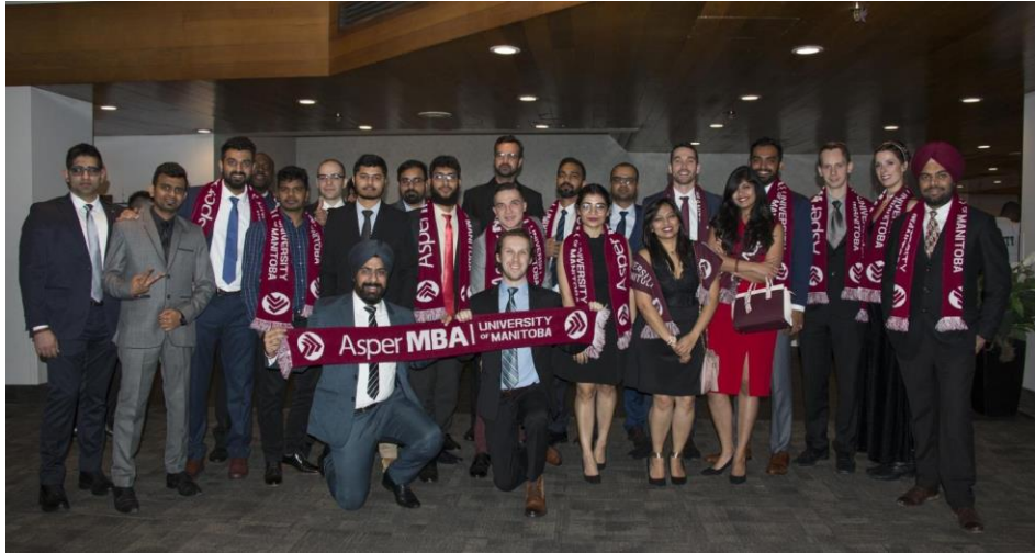
Asper MBA Student Association (aMBAsa) at the 2020 MBA Games

The mission of the Asper MBA Student Association (aMBAsa) is to enhance the MBA student experience by creating opportunities for students to form lasting relationships with their colleagues and the wider Manitoba business community. Throughout the 2019-2020 academic year the aMBAsa hosted three events for the students; a graduation mixer in June 2019, a Bollywood Night fundraiser in December 2019, and a winter mixer in January 2020.