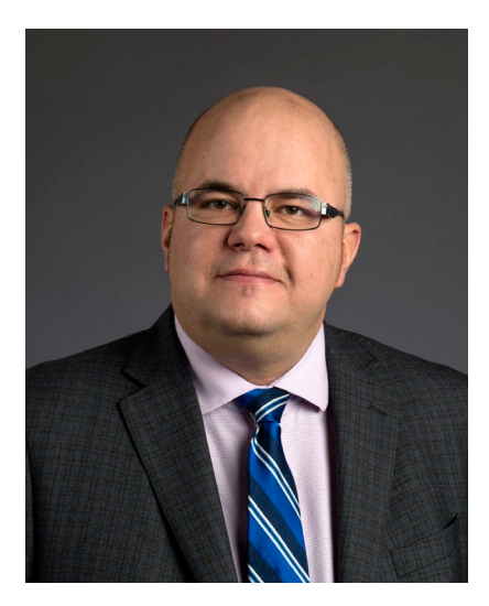
Topics of Interest: Strategy Entrepreneurship Human Resources Leadership Marketing