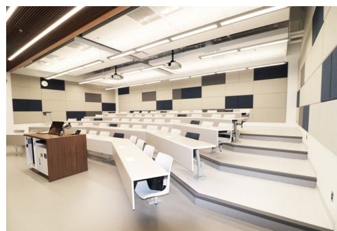
Drake 140- After